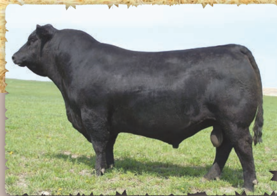
SAV 004 Predominant 4438