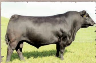
SAV Iron Mountain 8066