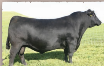
SAV Pioneer 7301